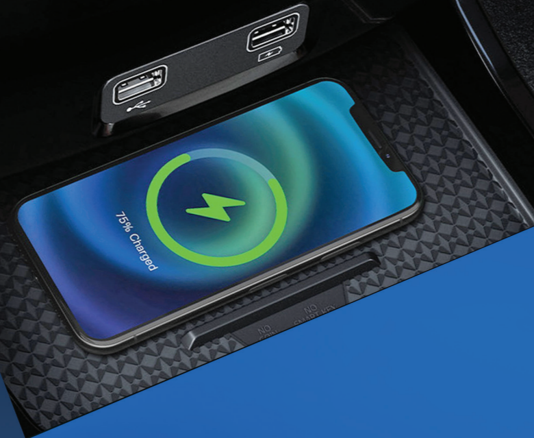
| WIRELESS CHARGING PAD